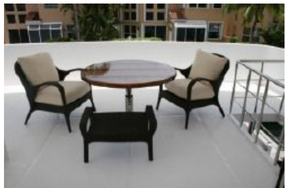
> Skylounge Aft deck