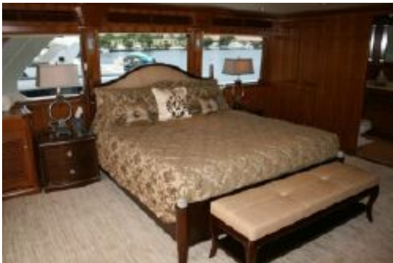
> VIP Skylounge Stateroom