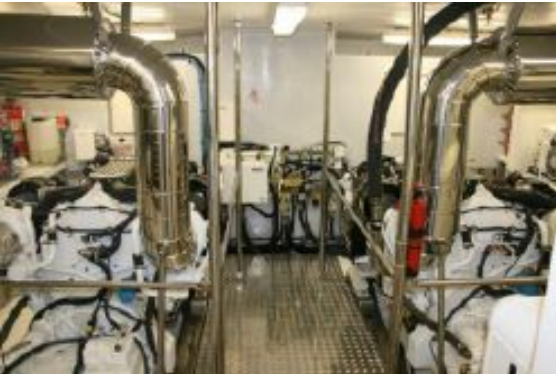
> Engine Room