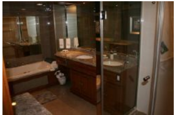
> Master Bath