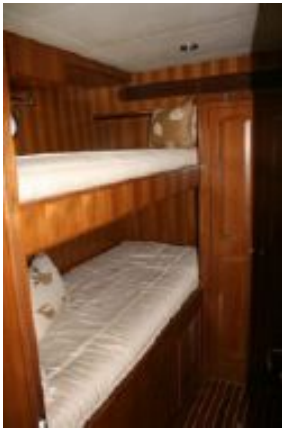
> Crew Quarters