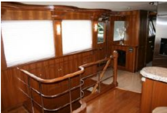
> Main Foyer