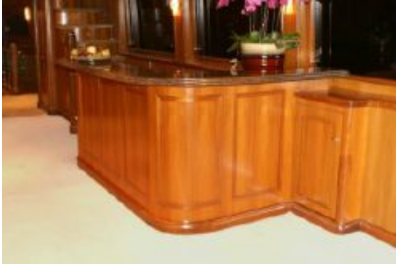
> Salon Bar