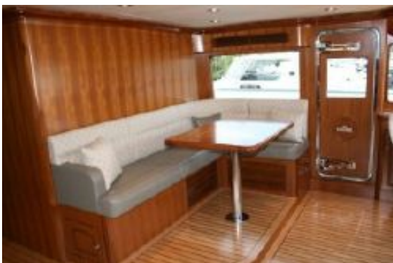
> Wheel House Settee