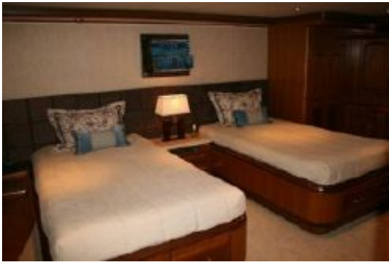
> Guest Stateroom