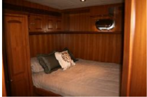
> Captains Quarters