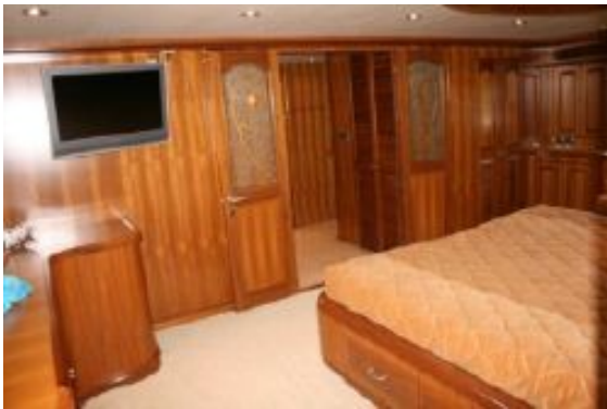
> Master Stateroom Aft View