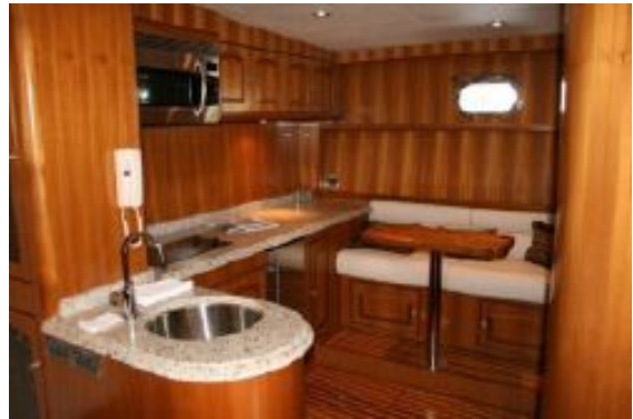
> Crew Lounge