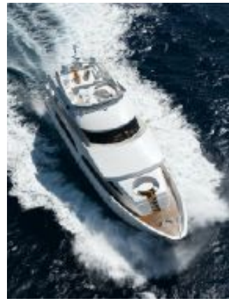
> Arial Running profile