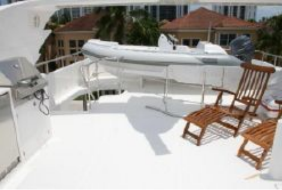
> Boat and Toy Deck