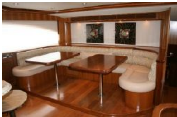
> Galley Settee