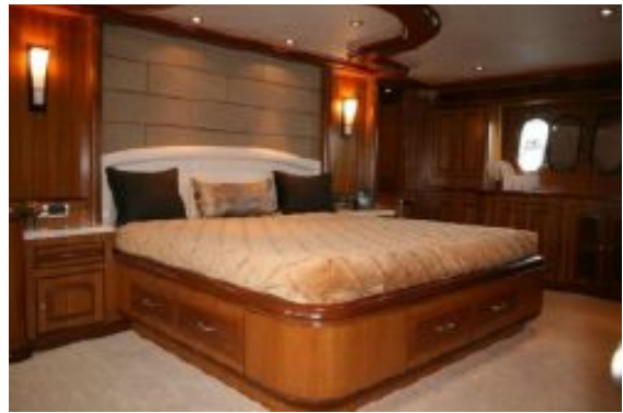
> Master Stateroom