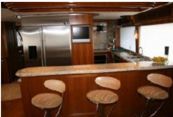
> Galley Aft View