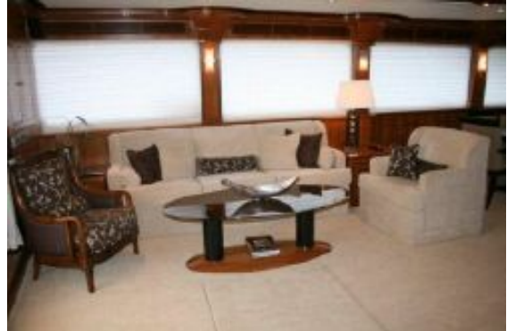
> Salon Sofa