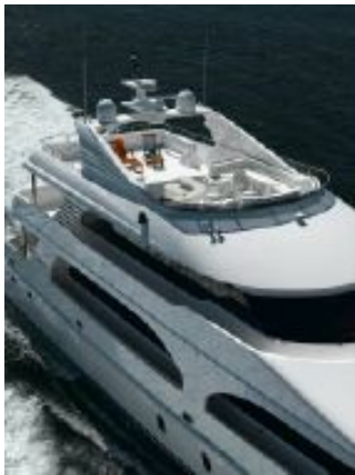
> Top deck profile