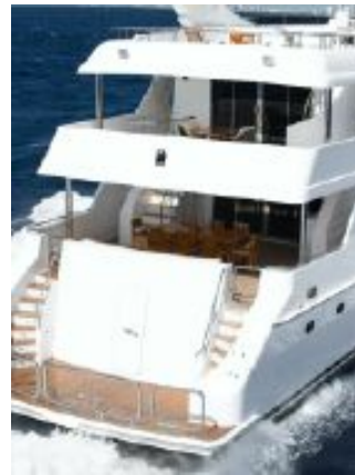
> Tri Level Decks Aft View