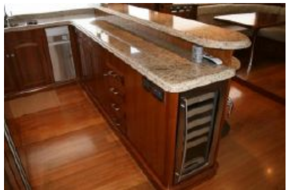
> Galley Side View